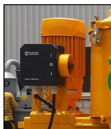
Cam Shaft Controller